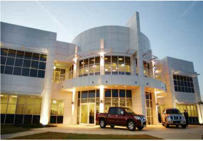
Center for Advanced Vehicular Systems, Canton, Mississippi

automotive suppliers the opportunity to be in close proximity to assembly plants throughout the region.